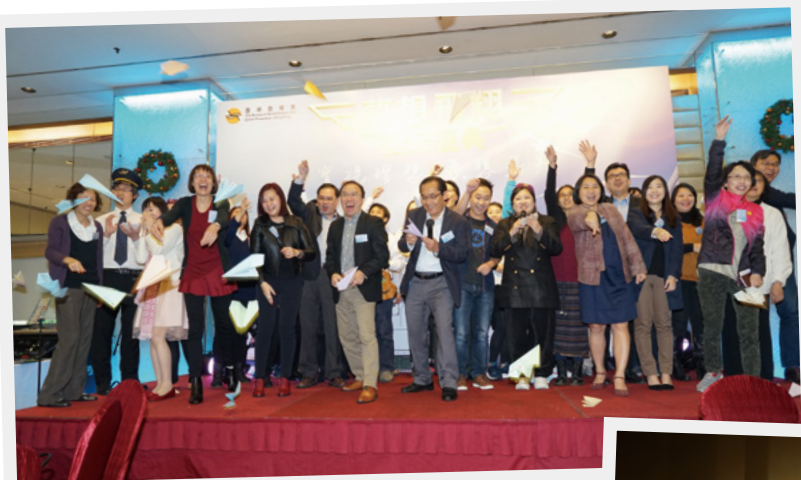
—眾嘉賓與同工出席夢想飛翔復元慶典 Our guests and staff showed support by attending The Recovery Celebration Ceremony.

於 2015 年「精神健康月」嘉許禮上，微電影創作比賽得獎團體接受獎項。 The winners of the micro-film making competition were awarded in the prize presentation ceremony of the 2015 Mental Health Month