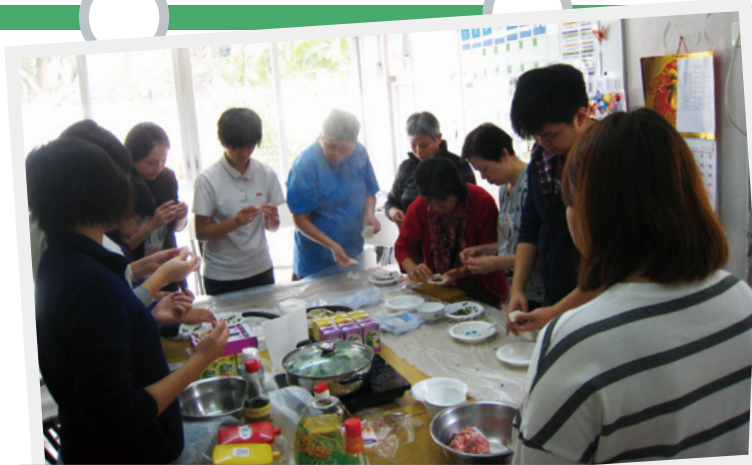
旺角街坊會陳慶社會服務中心的學生義工探訪怡翠軒，與服務使用者一起包水餃。 Student volunteers from The Mong Kok Kai Fong Association Limited Chan Hing Social Service Centre visited Yee Tsui House and made dumpling with service users.