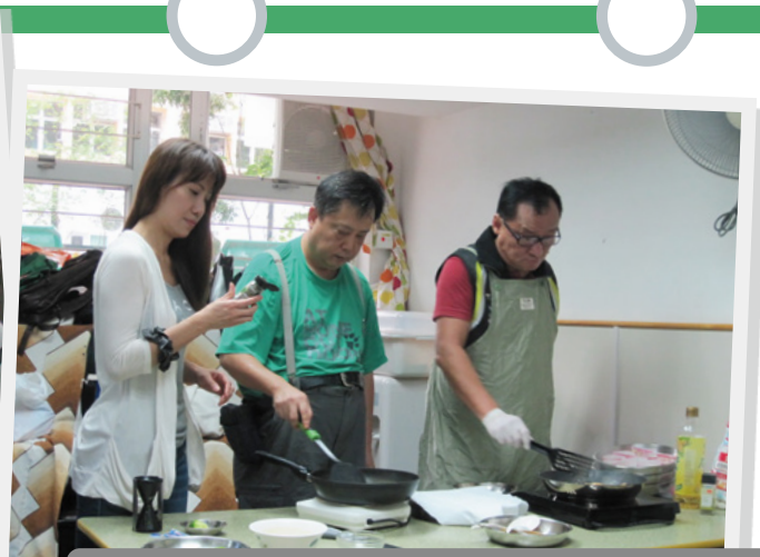
義工探訪智障青少年宿舍，即場為參加者烹調美食。 Volunteers visited the hostel for young people with intellectual disability. They demonstrated cooking skills and played games with the participants.