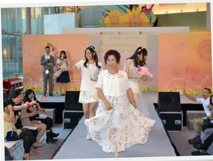
服務使用者跟香港理工大學學生一同演繹時裝表演。 Service users and the Hong Kong Polytechnic University students demonstrated the costume in the Catwalk Show.

A volunteer of Vitality Place instructed users to upcycle unused paper products as card models. The programme aimed at developing users' creativity and putting it into life. Under the guidance of the instructor, users created various exquisite card models including potting, Easter decorations, airplanes and flowers.