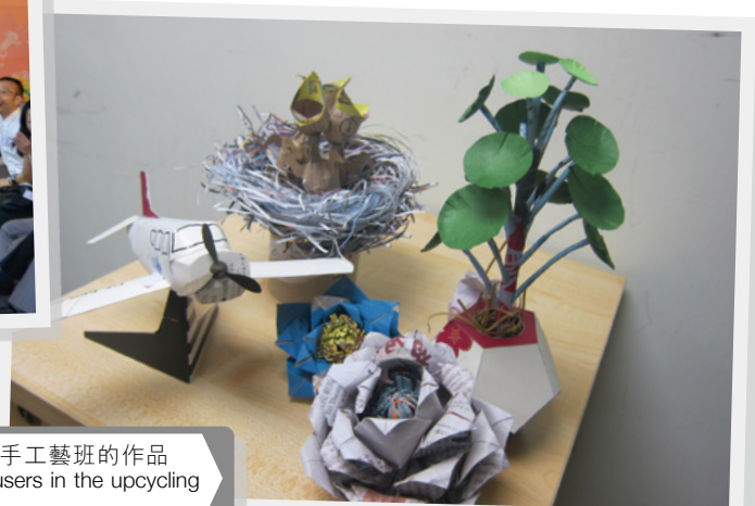
我要造紙模 - 環保手工藝班的作品 Products made by users in the upcycling card model class.