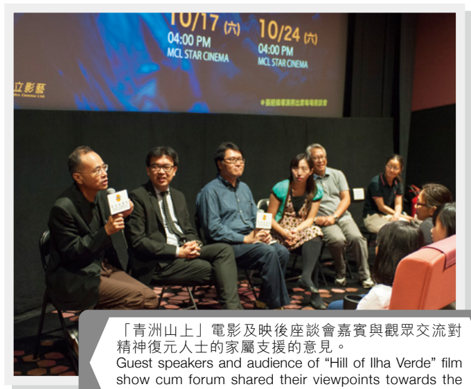
「青洲山上」電影及映後座談會嘉賓與觀眾交流對精神復元人士的家屬支援的意見。 Guest speakers and audience of "Hill of Ilha Verde" film show cum forum shared their viewpoints towards the family support of people in recovery.