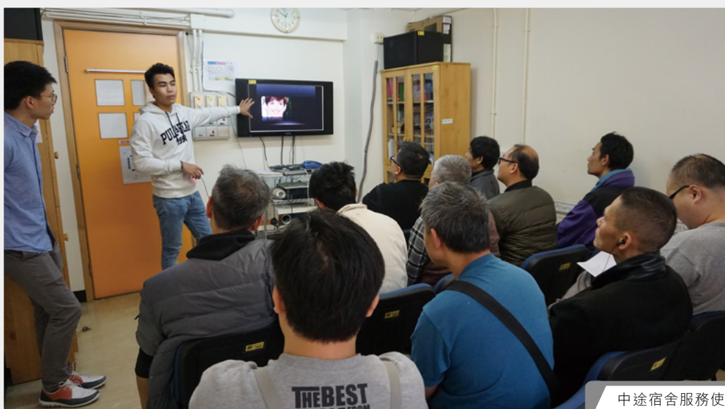
中途宿舍服務使用者參加戒煙講座。 Service users of halfway houses joined the Smoking Cessation Talk.