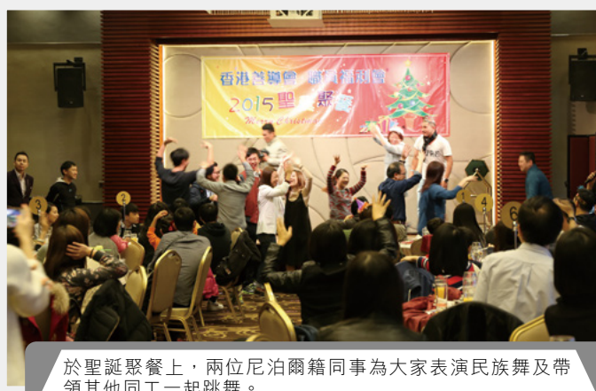
於聖誕聚餐上，兩位尼泊爾籍同事為大家表演民族舞及帶領其他同工一起跳舞。 Two Nepalese colleagues performed cultural dance and led other colleagues dancing together at the Christmas Gathering.