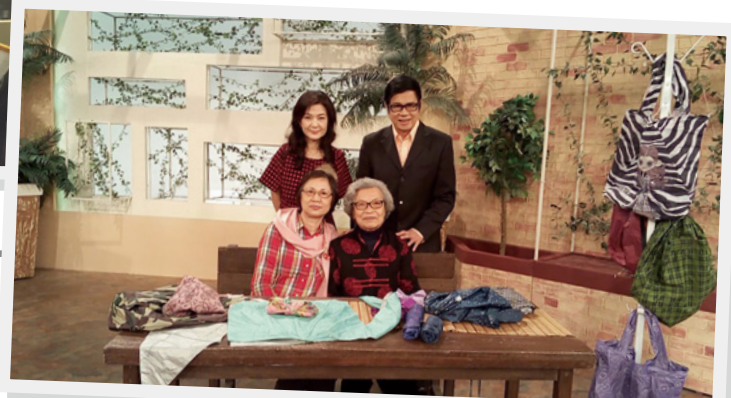
會友接受無綫電視節目邀請，拍攝「開心老友記」節目。 Service users being interviewed by TVB programme.