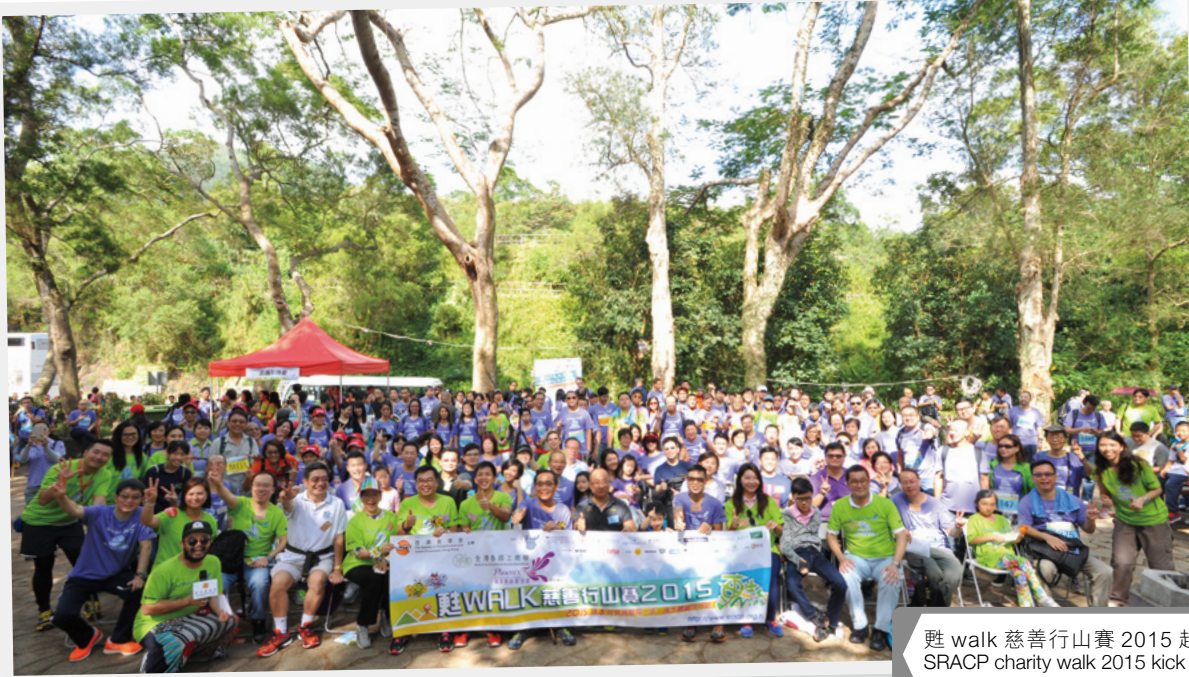
WALK 慈善行山賽 2015 起步禮 SRACP charity walk 2015 kick off ceremony