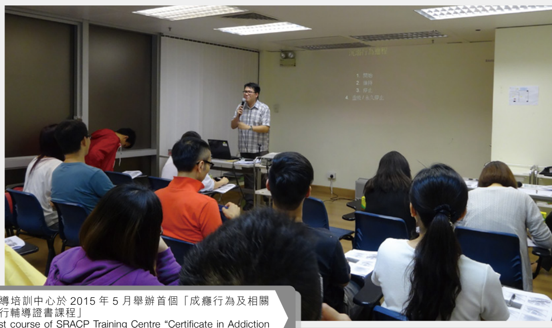
善導培訓中心於 2015 年 5 月舉辦首個「成癮行為及相關罪行輔導證書課程」 First course of SRACP Training Centre "Certificate in Addiction related offences and its Management" was launched in May 2015.