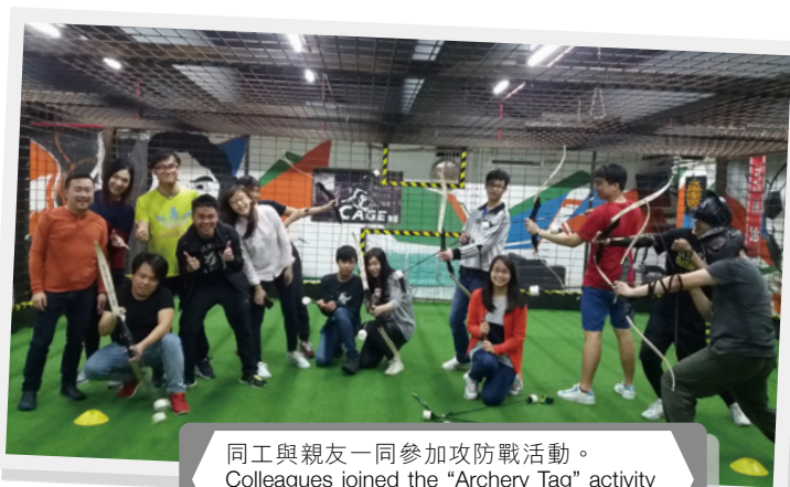
同工與親友一同參加攻防戰活動。 Colleagues joined the "Archery Tag" activity with their relatives and friends.