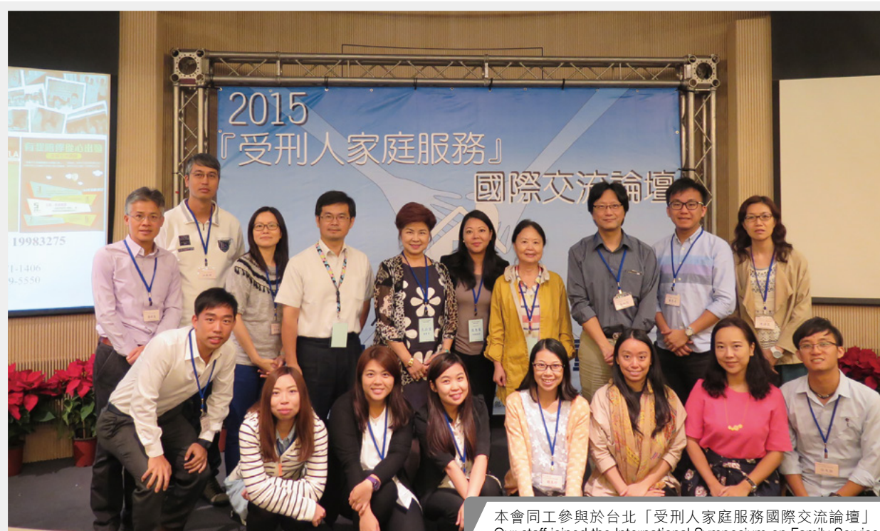
本會同工參與於台北「受刑人家庭服務國際交流論壇」。 Our staff joined the International Symposium on Family Service for Offenders in Taipei.