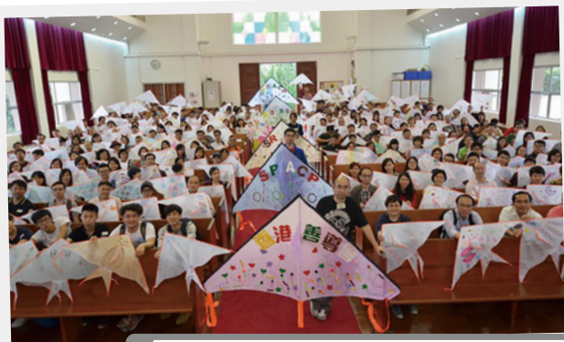
機構退修日，由同工自行製作的風箏於清水灣郊野公園上空迎風展翅。 The kites of SRACP flying over the sky at Clear Water Bay Country Park.

This year, SWA also facilitated the agency to design and organise an "Agency Retreat Day", which was held in Sai Kung. While enjoying the relaxing day, colleagues got more familiarised with other units' services. The retreat did not only foster team building among colleagues from different units, but it also united all colleagues for agency's betterment.